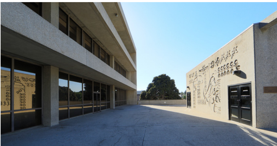
Left Lecture Hall Facade on the entry level