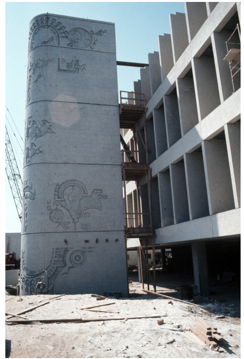
Construction Photo Courtesy of the Inglewood Public Library Collection above.